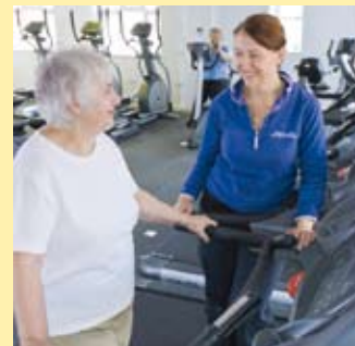
Images from Draper's restaurant, gym and The Salon.

the option of attractive two-storey town houses, or if people prefer single-level living, they have a choice of delightful bungalows, apartments or flats. All properties feature two spacious bedrooms.